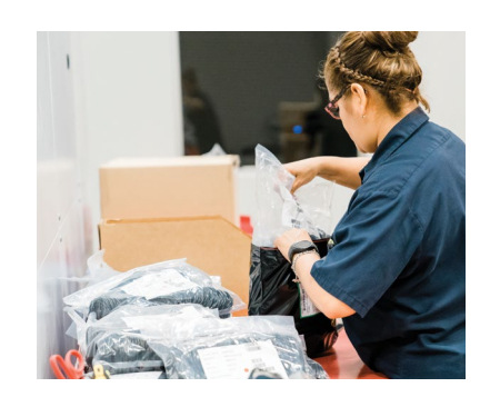
98% of all orders meet our customer required dates (including same day) – time is money!

Same day shipment available for critical orders.