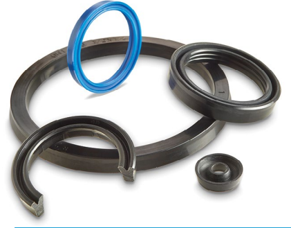
U-Seals 50+ styles in both inch and metric sizes, loaded and unloaded, in various materials.

Global O-Ring and Seal is your one-stop source for seals and related products with hundreds of styles and thousands of hydraulic seals in inch and metric sizes. Most orders are shipped out the same day.