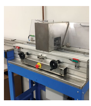
Global O-Ring makes a continued investment in automation and precision vulcanization equipment to be the best in the industry.