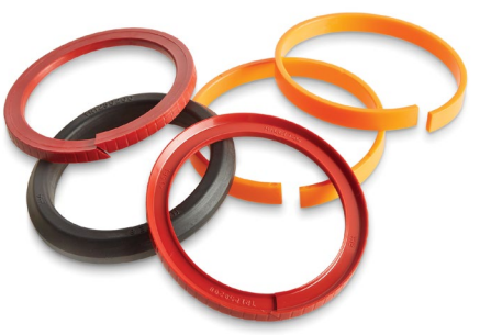
Piston Seal Assemblies 50+ styles in both inch and metric sizes, available in various materials.