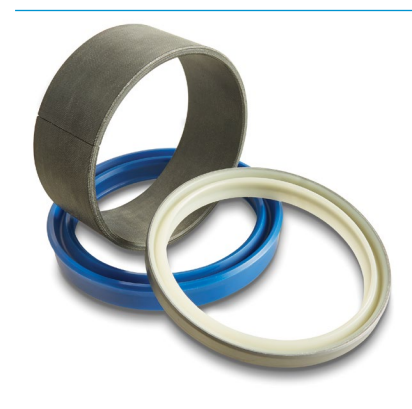
Mobile Seal Kits 150+ heavy mobile equipment models including Caterpillar, John Deere and more.