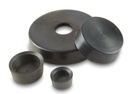
Piston Cups 200+ part numbers in both inch and metric sizes, available in various materials.