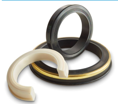
Hammer Union Seals 15+ styles in several materials with or without Bass or SS ring.