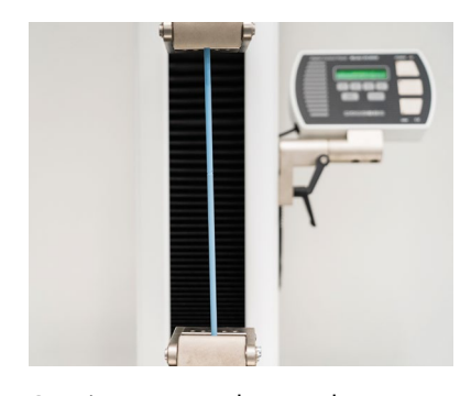
Continuous product and process testing ensure tensile strength of joint and cord exceed specifications and customer requirements.