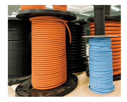
Over 450 cord varieties and over 1 million feet in stock – combinations of profile, material, cross section, durometer and color.