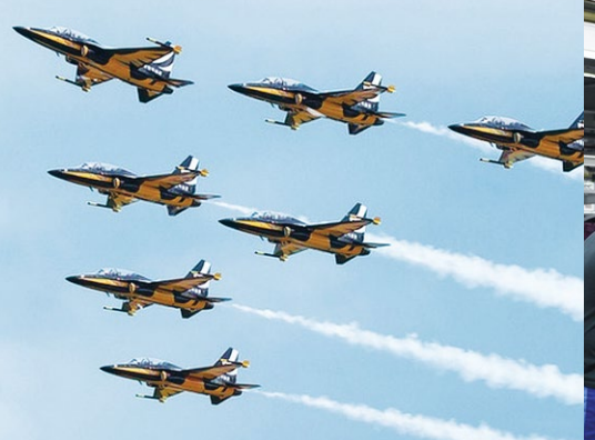
AEROSPACE & MILITARY