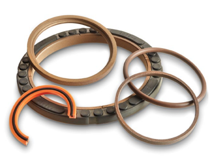
Buffer Rings 15+ styles in both inch and metric sizes, over 400 total part numbers available.