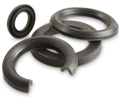
Vee Packing 600+ sizes in both inch and metric sizes, available for most major brands.