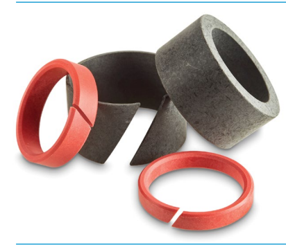
Wear Rings & Bearings 2000+ part numbers in both inch and metric sizes, available in various materials.