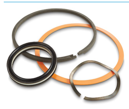
Industrial Seal Kits 600+ cylinder types for the major industrial cylinder manufacturers.