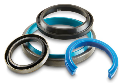
Wipers 50+ part numbers in both inch and metric sizes, available in various materials.